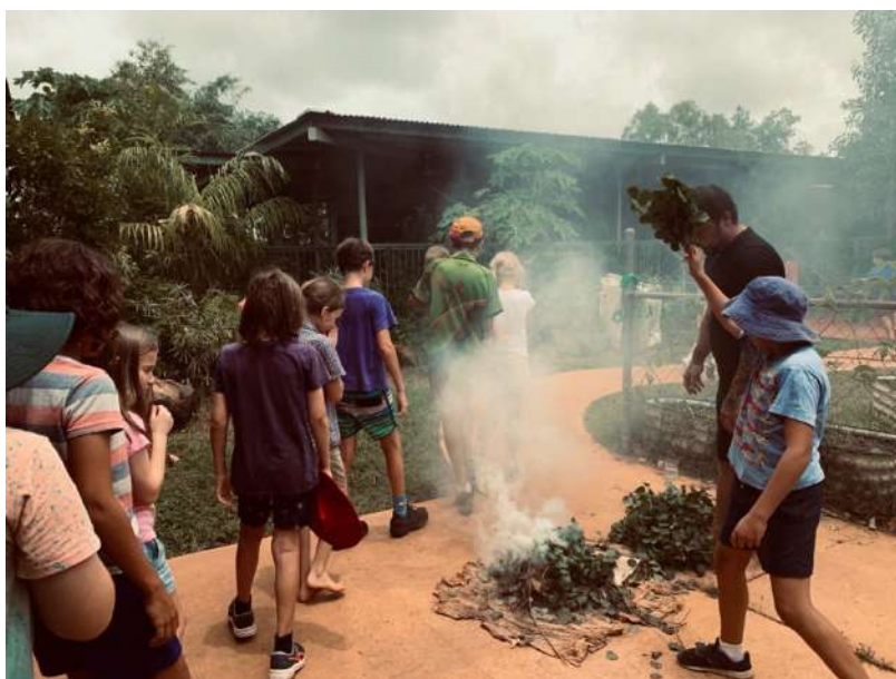
Image: Djandjag Smoking Ceremony, 2021