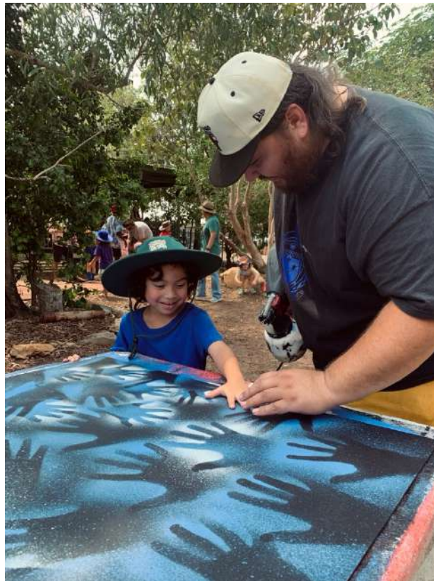
Image: Milkwood's Outdoor Classroom Mural project, 2024