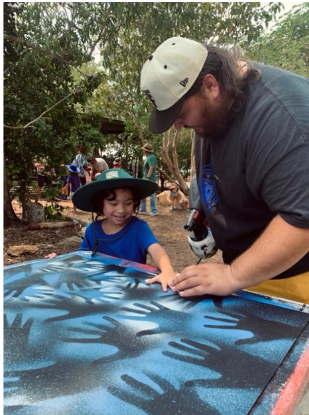
Image: Milkwood's Outdoor Classroom Mural project, 2024