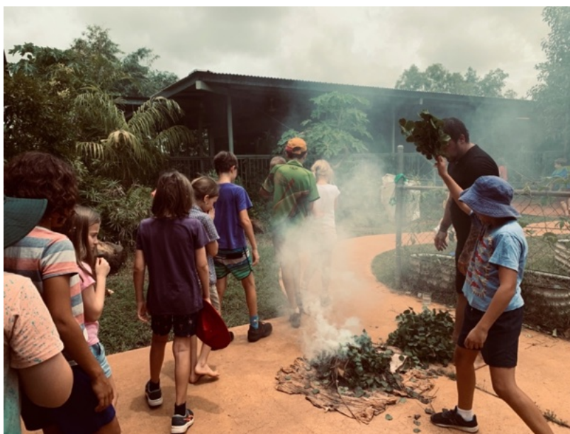
Image: Djandjag Smoking Ceremony, 2021